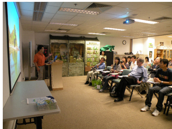
The talk / 講說中