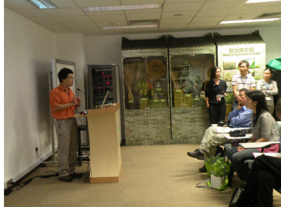
Q & A – Why & How / 答問中 – 為什麼？.....如何做到？.....