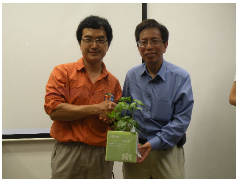
Thank You / 謝謝